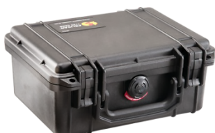
1150 Small Case

Pelican's small size cases offer watertight, crushproof, and dust-proof protection for your equipment. These cases have automatic pressure equalization to balance interior pressure. Secure double throw latches and stainless steel hardware. Pick N Pluck foam is optional for each case.