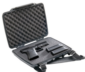
P1075 Pistol Case