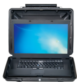
1095 CC Laptop Case

Pelican's Hardback cases have been specifically designed for your smaller but sensitive and valuable equipment. The Hardback style cases are used commonly for Laptops, Tablets, and Pistols. Each of these cases is watertight, crushproof, and dust-proof. They each utilize a watertight gasket and automatic purge valve to balance air pressure and keep water and dust out. Pistol cases include lockable hasps to keep your valuables safe. Each case is customizable with Pick N Pluck foam.