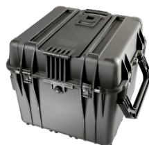
0340 Cube Case