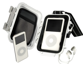
i1010 iPod Case

As an exclusive vendor of Pelican Products, our offering of the Pelican Micro Case line includes cases used in safely storing and transporting even your smaller sized valuable equipment. This includes but is not limited to cases for: iPods, iPhones, Galaxy Phones, Memory Cards, and other valuable items. Our cases include crushproof protection with water and dust resistant seals.