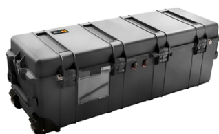
1740 Long Case