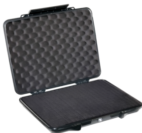
1085 Laptop Case