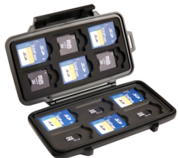
0915 Memory Card Case