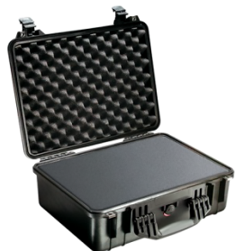
1520 Medium Case

Pelican's medium size cases also offer watertight, crushproof, and dustproof protection for your equipment. These cases also feature automatic pressure equalization to balance interior pressure. Secure double throw latches and stainless steel hardware. Pick N Pluck foam is optional for each case. Our medium sized cases offering also includes mobile cases with heavy duty polyurethane wheels, stainless steel bearings, and a retractable extension handle. Our other models include cases that have been specifically designed for laptop computer storage, the mobile tool chest, and our EMS organizer cases.