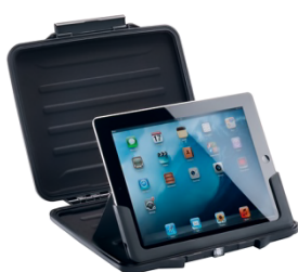
i1065 Tablet Case