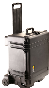
1560M Mobility Case