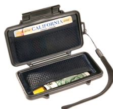
0955 Sport Wallet