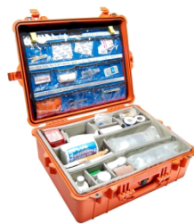
1600 EMS Case