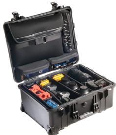
1560SC Studio Case