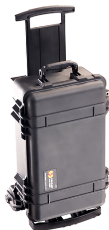
1510M Mobility Case