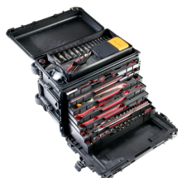
0450 Mobile Tool Chest