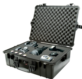
1600 Large Case

Pelican's medium size cases also offer watertight, crushproof, and dust-proof protection for your equipment. These cases also feature automatic pressure equalization to balance interior pressure, secure double throw latches and stainless steel hardware. Pick N Pluck foam is optional for each case. Our large sized cases offering includes models specifically for studio and laptop equipment as well as our large mobile tool chest. Our large case offering also includes mobile & transporter cases for easy transportation. We also provide an array of sizes and shapes specific to your needs with models such as our large, long, rifle, cube, and EMS cases.