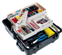
1460TOOL Mobile Tool Chest