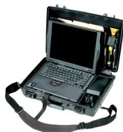
1490CC1 Laptop Case