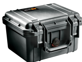
1300 Small Case