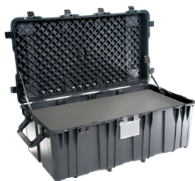
0550 Transport Case