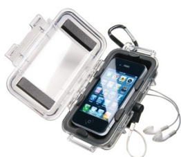
i1015 iPhone Case