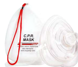
Pocket Mask w/ O2 Inlet