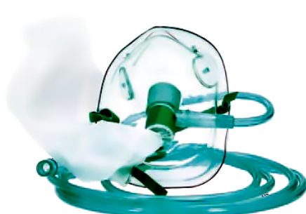
Total Non-Rebreathing Mask