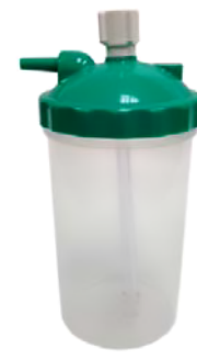
Medium Flow Model