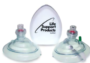
Mouth to Mask Resuscitator