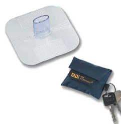
MDI CPR Microkey™