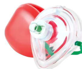
Curaplex Pocket Mask