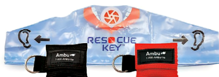
Ambu Rescue Key