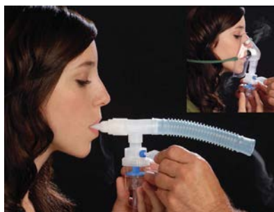
Continuous Care Nebulizer

Stratodyne offers a wide variety of Nebulizers certain to meet the needs of your specific patients. Adult, child, & pediatric models are available for most products as well as both mouthpiece or mask delivery options. Newer products allow for the refilling of medication without disruption of patient treatment. Our selection also includes complete kits that can enable you to have all necessary and needed components at your fingertips within a moment's notice.