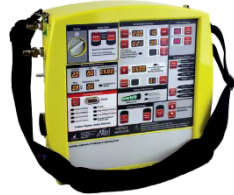
AHP300 Transport Ventilator