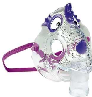
Nic the Asthmatic Dragon Mask