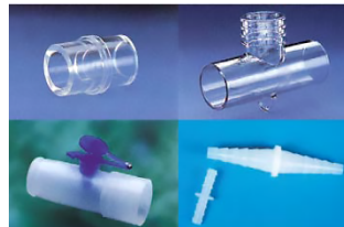
Adapters & Connectors

Stratodyne offers a full array of Resuscitator Accessories including, but not limited to: Airflow Resuscitation bags (w/ all sizes and additional options available), many different styles of masks, PEEP Valves as well as the Smith Medical OXY-PEEP™, adapters, connectors, and elbows. Please contact Stratodyne today for a full listing of available accessories.