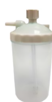
High Flow Model