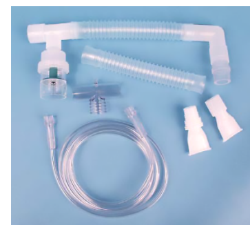
BVM Neb Assist Combo Kit