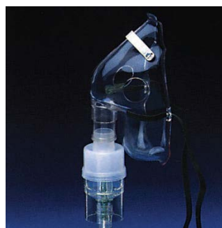
UpDraft II® Nebulizer with Mask