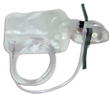
Partial Non-Rebreathing (3-in-1) Under the Chin Style