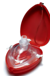
Ambu Res-Cue Mask