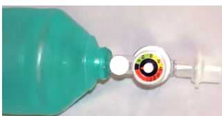
Ventlab Airflow Resuscitation Bags