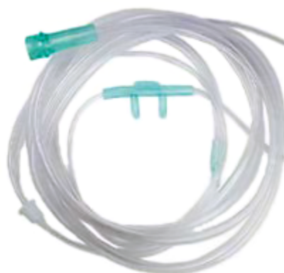
Nasal Cannula with Nonflared Tips

Please visit StratodyneInc.com for a complete product listing today!!