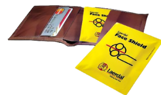
Resusci Face Shield