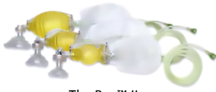
The Bag™ II