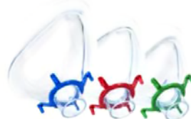
Air Cushion Masks