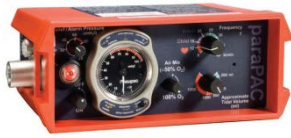
Pneupac® paraPAC Ventilator