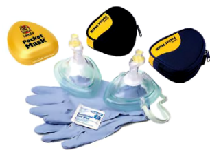
Laerdal Pocket Mask™