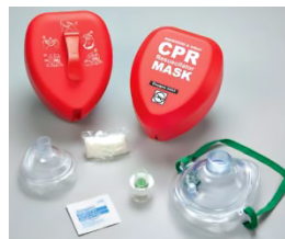
CPR Mask Set In Case