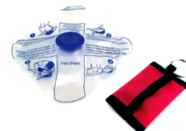
MedSource CPR Keychain