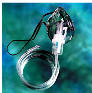
MicroMist® Nebulizer with Mask