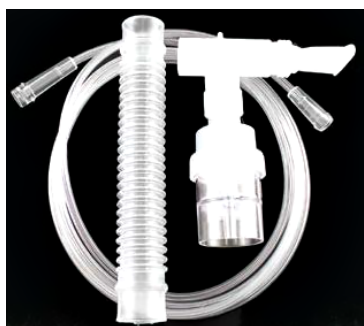
Mini Nebulizer Adult Hand Held