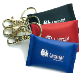
Resusci Face Shield Keychain