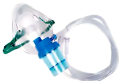
Nebulizer Mask Combination